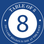
Table of 8 $550

To purchase tickets, please mail fax or email this form with a check or confirmation of PayPal payment to: