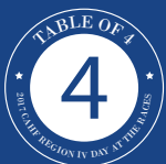
Table of 4 $275